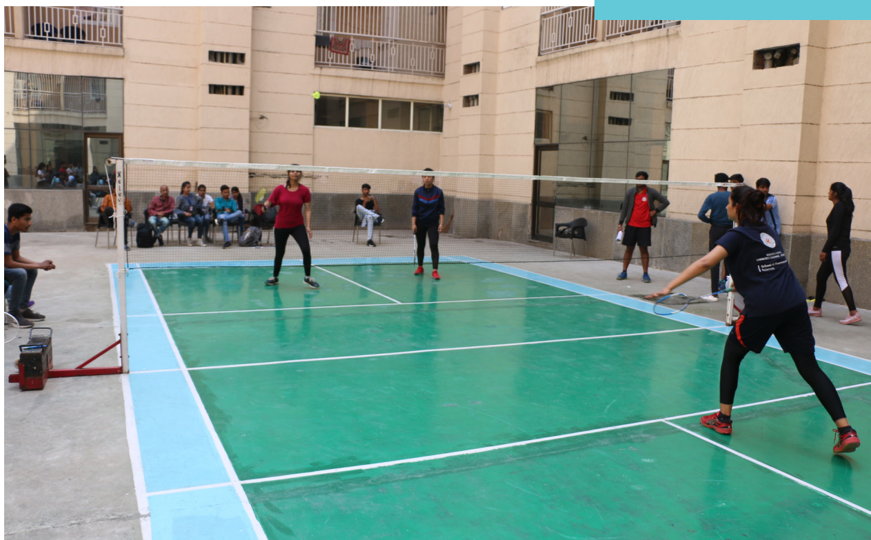
The campus has well established indoor and outdoor sports facilities and encourages students to participate In Sports events Zest, Sportura and Collympics.