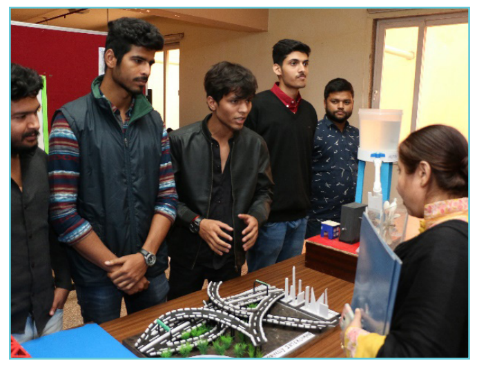
Scizone - 2019

School of basic and Applied Sciences organize different types of events like guest lecture, scizone, science olympiad, poster competition, debate competition etc. which help the students to engage themselves with peers. This kind of involvement can become be a launching pad for lifelong friendships, professional development, networking, and career paths.