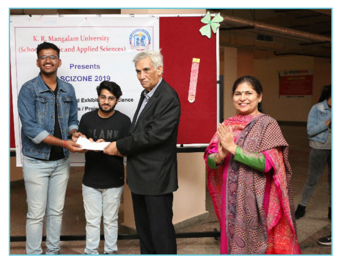
Prize Distribution in Scizone