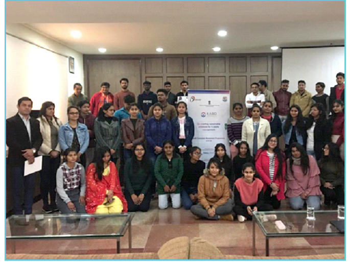
Awareness Session of E-Waste Management